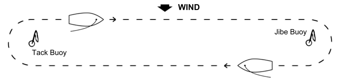
Figure 2. Reaching Course with Tack and Jibe

The second course you will sail will also have two buoys set perpendicularly to the wind. As shown in Figure 2, this course will require one tack and one jibe. You will sail around this course in an oval. As you approach the jibe buoy, think about which way you'll turn. As you start to turn downwind, stand up, switch hands behind your back, sit back down on the opposite side of the boat before you get directly downwind. Watch the wind direction on the tell-tales. After the stern of the boat crosses the eye of the wind (when you are by-the-lee ), be prepared to duck as the sail jibes over. Then straighten out the tiller and steer towards the next buoy.